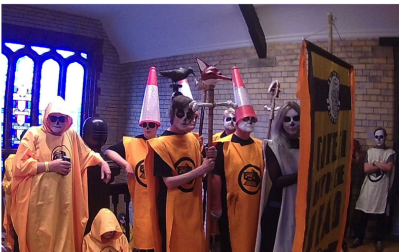
Toxteth Day of the Dead banners and totem bearers, 2017.