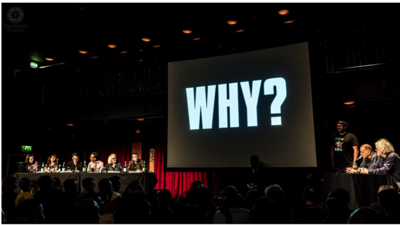
Panel: Why Did the K Foundation Burn a Million Quid?

The fate of the presentation was sealed with a bucket full of pound coins, miscellaneous small change and a token for the fairground at Pier Head. The KK / KLF historical mash-up won the public vote and I was happy to receive a nonchalant Whatever from Drummond and Cauty. The resonance of a K-continuum was reinforced by an eager crowd of people pressing affirming gifts into my hands, from G&T, a can of Red Stripe, business cards and invites, to a badge featuring the penny farthing from The Prisoner and the magic number 23.