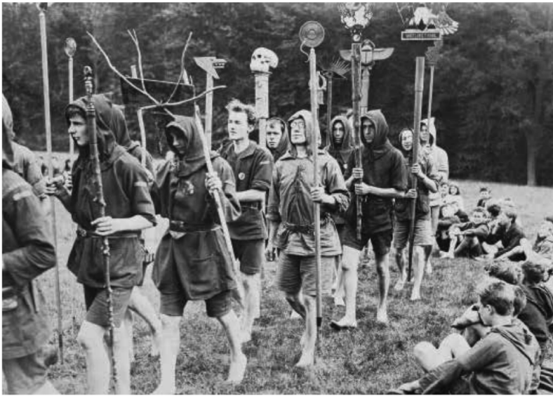
Kibbo Kift with Totems, 1925.

Annebella Pollen Panel