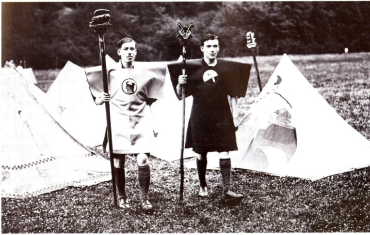
Kibbo Kift: Members at camp, 1928.

I needn't have worried. The spirit of playfulness was palpable on entering the venue on Wednesday night, and my economist, artist and journalist panel companions were in an equally amused mood. None of us, of course, knew why the K Foundation burned a million quid but each had cheerfully taken up the gauntlet. When I made my claim for a relationship between KK and KLF, there were sympathetic laughs, whoops and cheers. I ended: