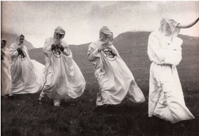
KLF: Still from The Rites of Mu, 1991

clear – meant that a similar tenor was sounded between the two organisations across time, and a sense of cultural rebirth and eschatological fervour was present in both groups. Most extraordinarily, this resulted in both cases in a fixation on money and its illusions .