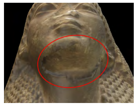
Figure 5: Misalignment on the chin area of the 'Bust' 3dDM.