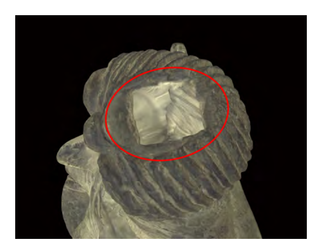
Figure 3: 'Horus' 3dDM showing texture inaccuracies due to missing geometry.

If the original object is not captured in a controlled lighting situation, the final 3dDM will have shadows and/or highlights present on the