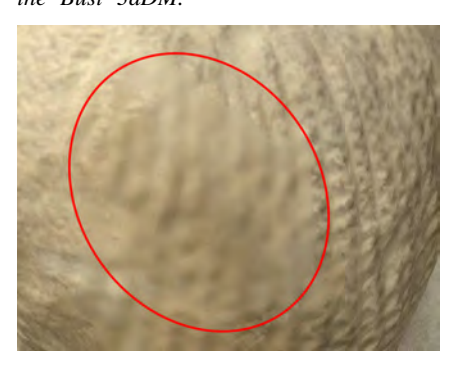
Figure 8: Localised blurring on the surface of the 'Bust' 3dDM.