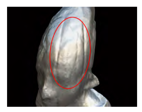
Figure 4: Cracks as displayed in the 3dDM's geometry.