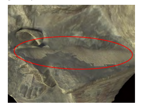
Figure 7: Texture inconsistency on the 'Horus' 3dDM.