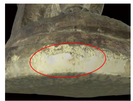
Figure 9: Overexposed area on the side of the base of the 'Horus' 3dDM.

object during capture (e.g. gallery light, harsh sunlight) permanently baked into its texture [PHHF16]. Similarly, if equipment such as a structured light scanner is used for acquiring the 3dDM, artificial brightness differences on the 3dDM's texture can occur if the scanner was held too closely to the object's surface. Brightness inaccuracies can be observed on the base and the plinth of 'Horus' (Figure 9).