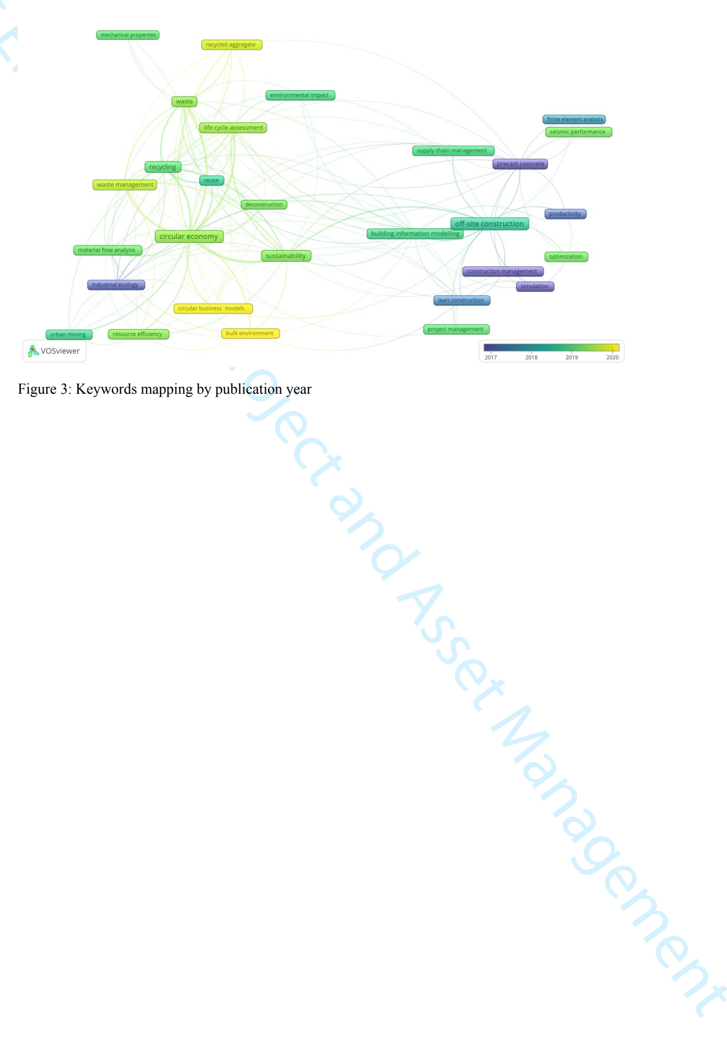
Figure 3: Keywords mapping by publication year