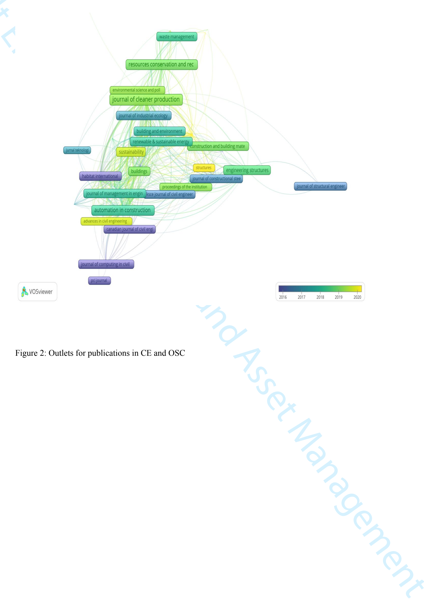
Figure 2: Outlets for publications in CE and OSC