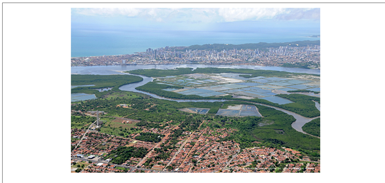
FIGURE 3 | Large mangrove cleared areas by shrimp farms at Potengi Estuary, Rio Grande do Norte State (Northeast Brazil). The mangrove island at the center-right of the image was almost totally converted to ponds.

in the forest drainage basin increase 10-fold to about 3,400 ha. It is interesting to note that there was no clear conversion of mangroves to shrimp ponds, but the occupation of tidal flats behind the mangroves has apparently affected hydrological processes, resulting in decreasing health of the mangrove fringe ( Supplementary Figure 1 ). Unfortunately, this reduction in health is not computed as mangrove area loss reported in the literature, suggesting that more than 8% to 10% of mangrove forest loss relative to shrimp pond area, normally accepted as converted, is affected by hydrological changes promoted by pond installation in this region. Considering these results and the areas with NDVI < 0.1 ( Supplementary Figure 2 ), literally equivalent to bare soil, between 9.6 and 14.4% of the local mangrove total were significantly affected by shrimp aquaculture.